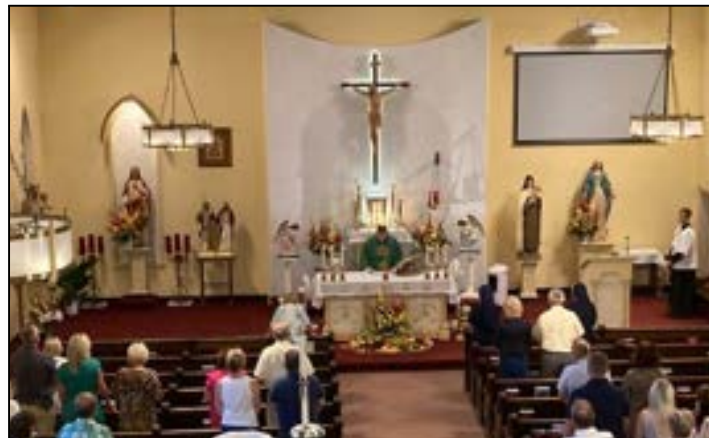
PHOTO-MEMORY OF THE SOLEMNITY OF THE ASSUMPTION OF THE BLESSED VIRGIN MARY / FOTO-PAMIĄTKA Z UROCZYSTOŚCI WNIĘBOWZIĘCIA NMP